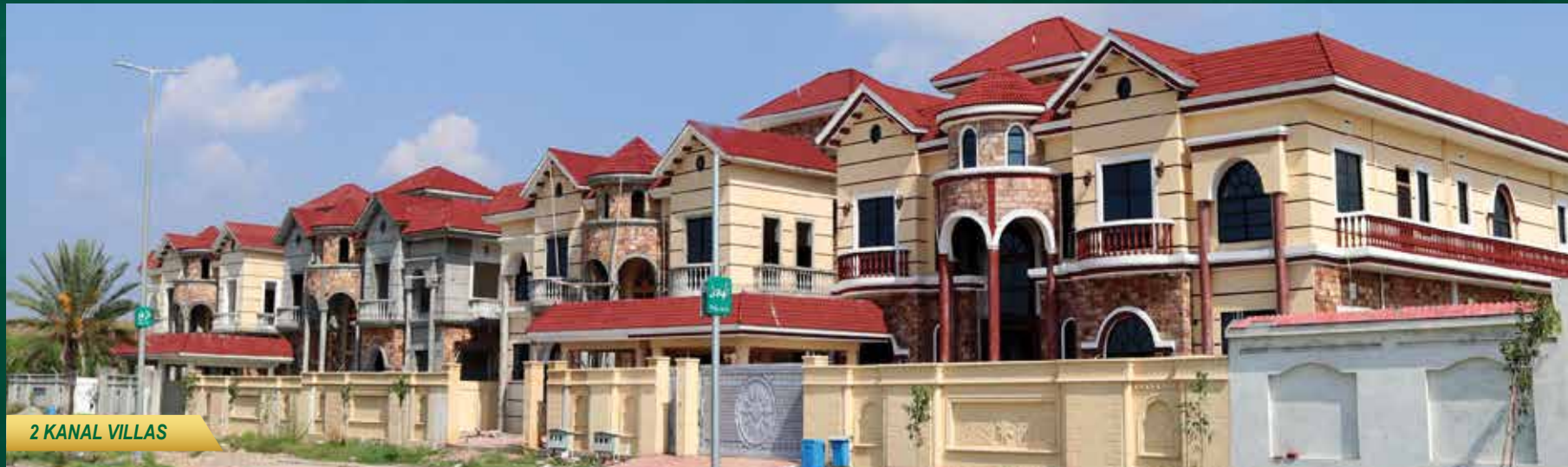
2 KANAL VILLAS