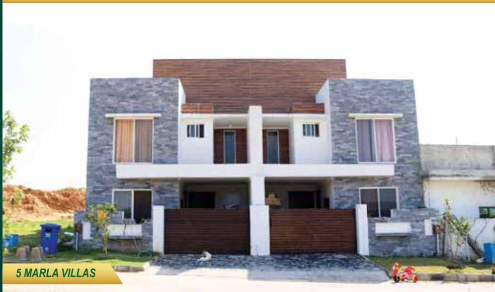
5 MARLA VILLAS