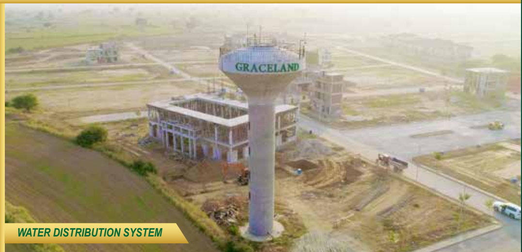
WATER DISTRIBUTION SYSTEM