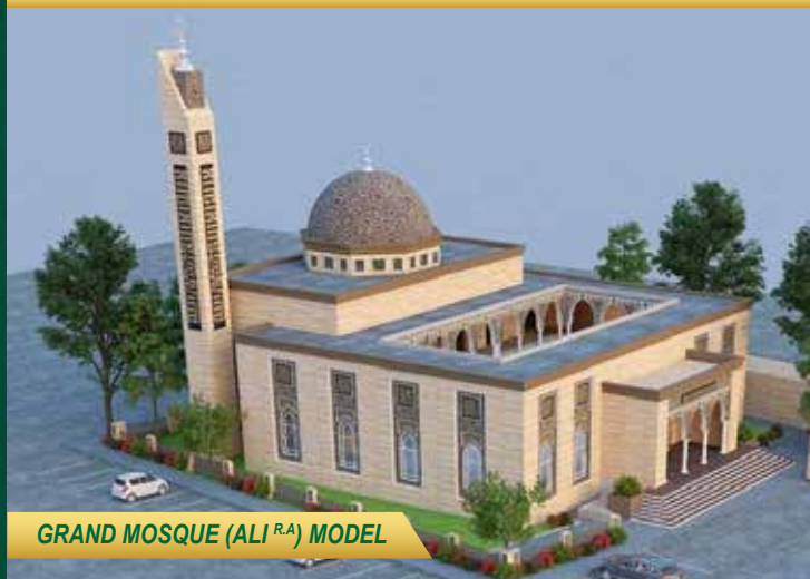
GRAND MOSQUE (ALI RA ) MODEL