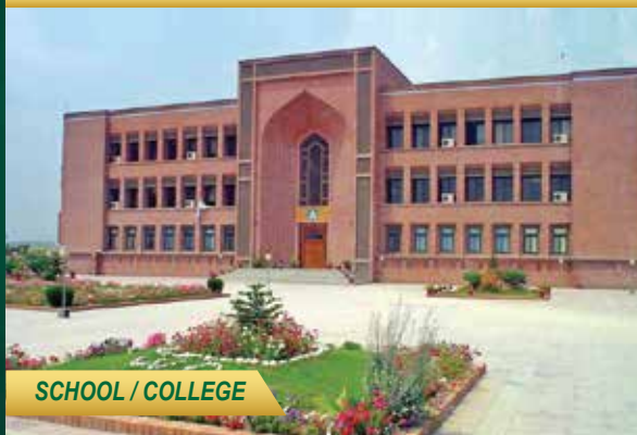
SCHOOL / COLLEGE