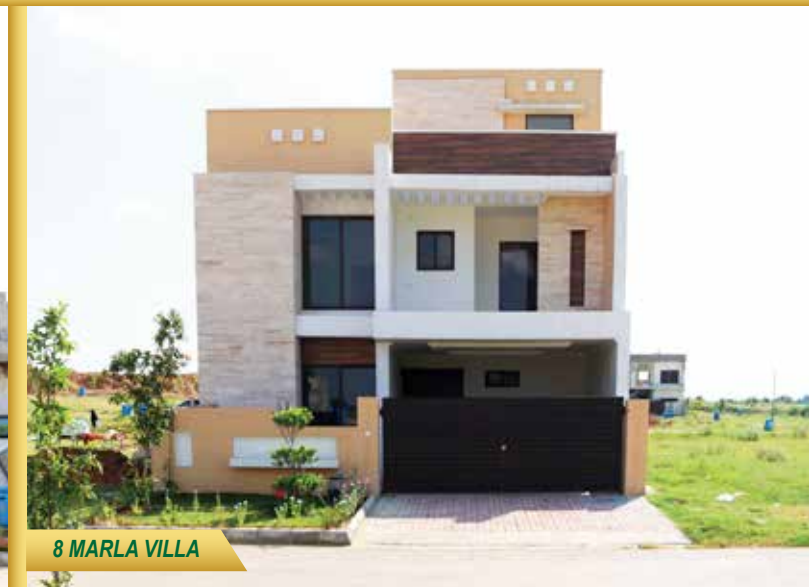
8 MARLA VILLA