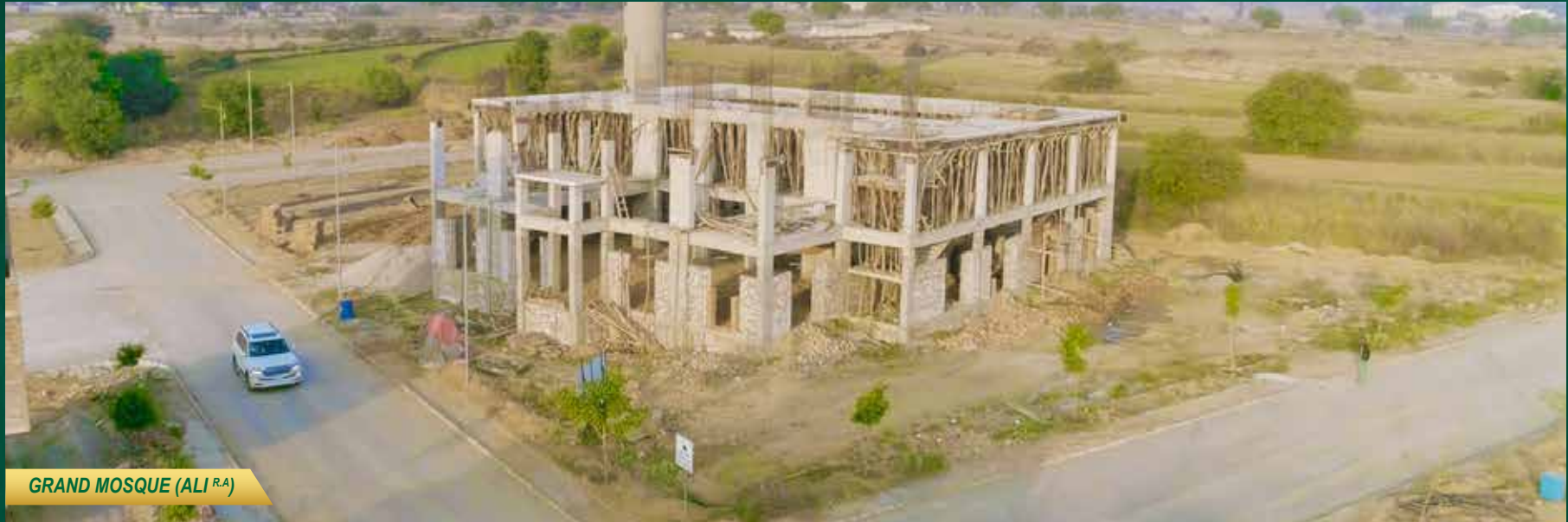
GRAND MOSQUE (ALI RA )