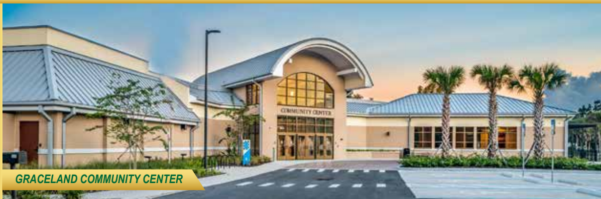
GRACELAND COMMUNITY CENTER