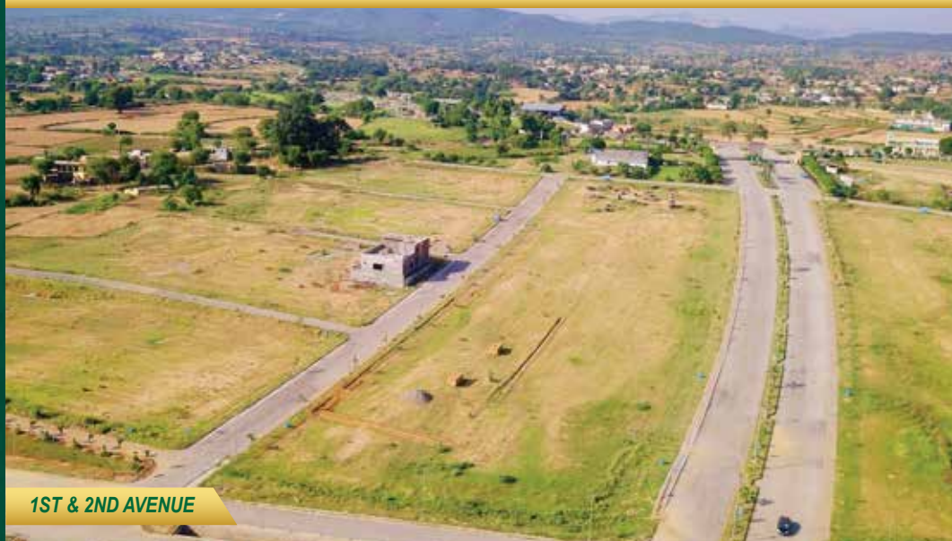
1ST & 2ND AVENUE